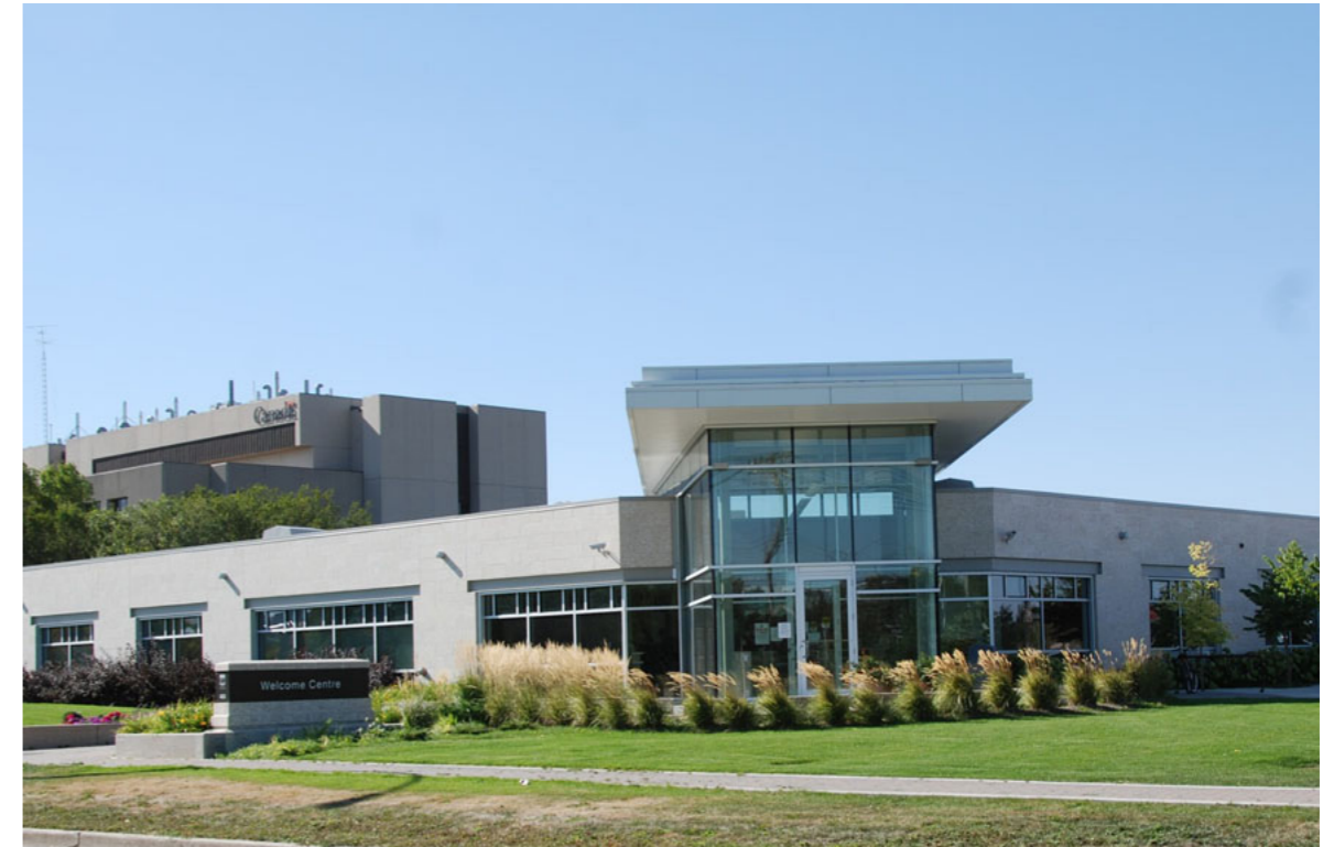
Welcome Centre 423 University Crescent

Security Services is continuously assessing the current safety initiatives and examining future plans in an effort to provide the highest quality of safety and security on campus.