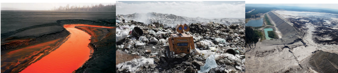
“Nickel Tailings no. 34” Edward Burtynsky; Wall-E Amidst the e-waste ; Mount Polley Mine Disaster near Quesnel, BC