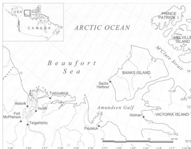
FIG. 1. The study area: Sachs Harbour on Banks Island, Northwest Territories.

The project began in 1999, with a collaborative planning workshop to establish joint objectives, define the scope of the study, and identify key issues from the community point of view to guide the work (Ford, 2000). The project team made three more trips to the community between June 1999 and May 2000 and a follow-up visit to conduct a final workshop and evaluation in 2001. For the