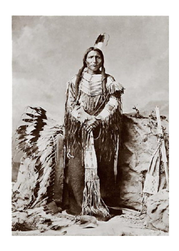
"Upon suffering beyond suffering; the Red Nation shall rise again and it shall be a blessing for a sick world.

A world filled with broken promises, selfishness and separations.