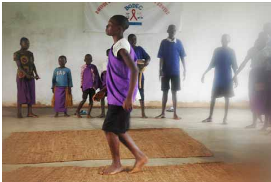
An orphan dances at Buhoma Orphans Development Corporation

traditional healer; banana brewery; Batwa community; Buhoma Community Camp; Observations on these communities – Buhoma is a well-developed community tourism initiative that accesses UWA revenue sharing and initiated a gravity water system for Buhoma and communities up to 5km away. Local tour companies/tourist camps contributed also – Nyundo: met with community leaders, guides in training – the main product is named eco-trails, also includes “heritage/cultural themed” trails, banda accommodations were built but never used – brochure is available, store with organic local products and sign about trails located in Buhoma.