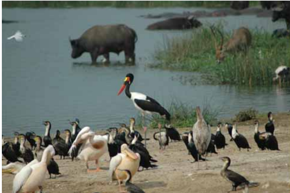
Saddlebill, Pelicans and Cormorants on the Channel