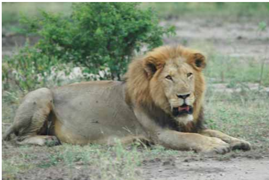
Lion in Queen Elizabeth NP

June 26, 2007 Game drive in Queen Elizabeth