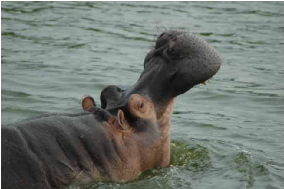
Hippopotamus on the Channel