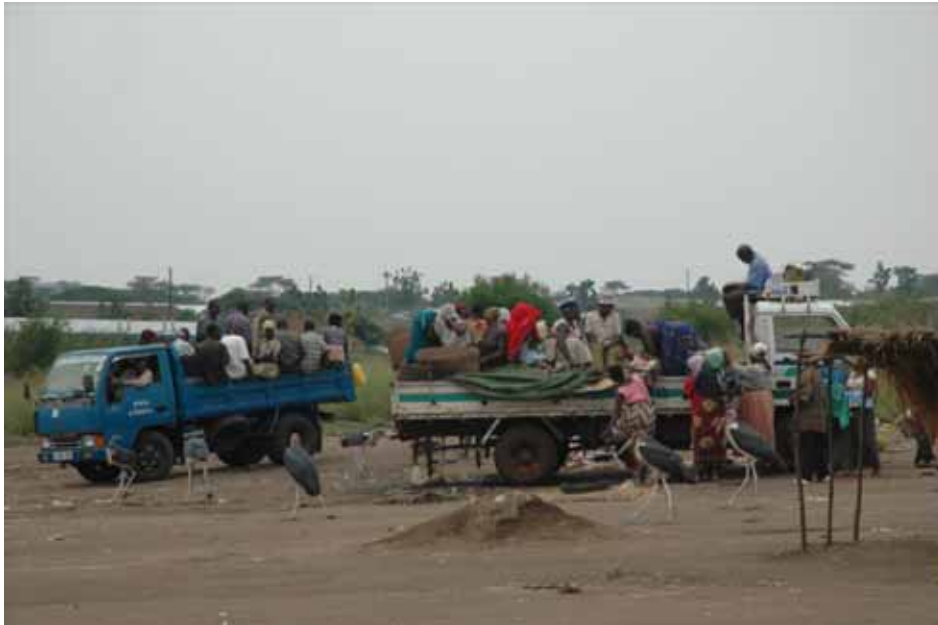
Kikorongo skeleton fish market