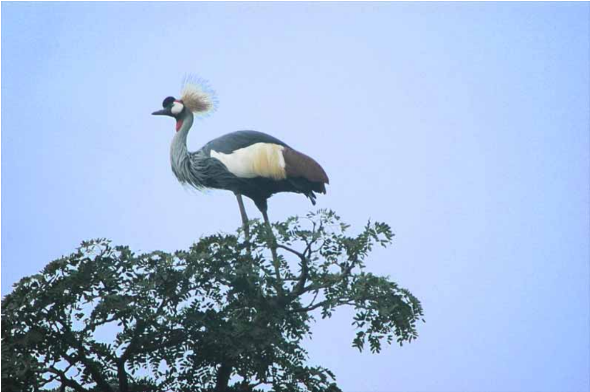
Uganda National Bird