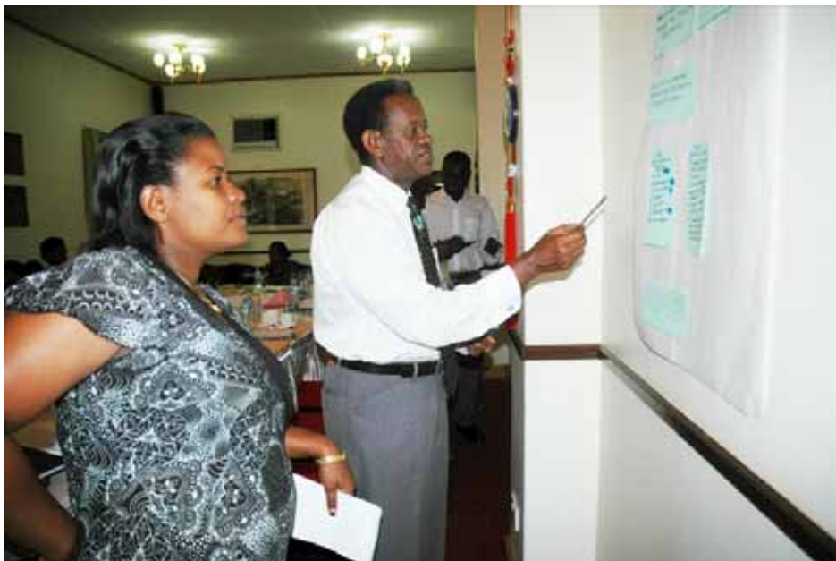
DACUM Workshop identifying challenges and gaps to address in Project

June 19, 2007 Team meeting at Kampala Club