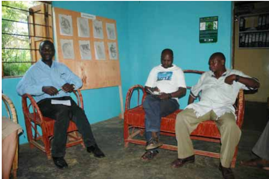
Meeting with KAFRED