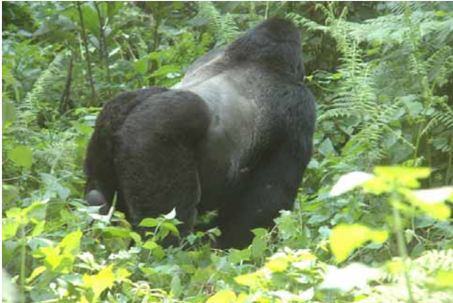
Silverback on the go in Bwindi Impenetrable NP

June 24, 2007 Visit to Ruhija Community, Meeting with Community leaders and members (IPC, LC1). New Gorilla Habituation Project – Spectacular drive, Mountains, high field and forests 2285m – CPI Community Protected Area Institution; Community resource assessment – swamps, waterfalls, old crafts, village tours; village heritage tours of: smithwork, dancing, forests and birds, lodges. Critical issues – 1) have land near the park but don't have financial resources to develop it; 2) urgency as tour companies buy land. Cody presented research on gorillas, habituation of gorilla family in 6 months (early 2008).