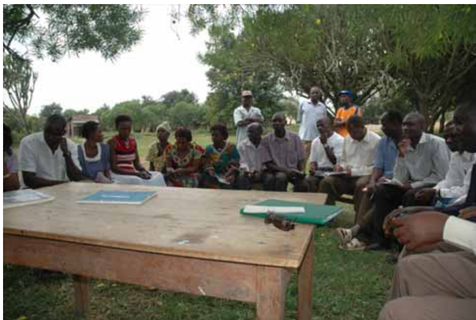
Katanguru community meeting with project team and UWA Wardens