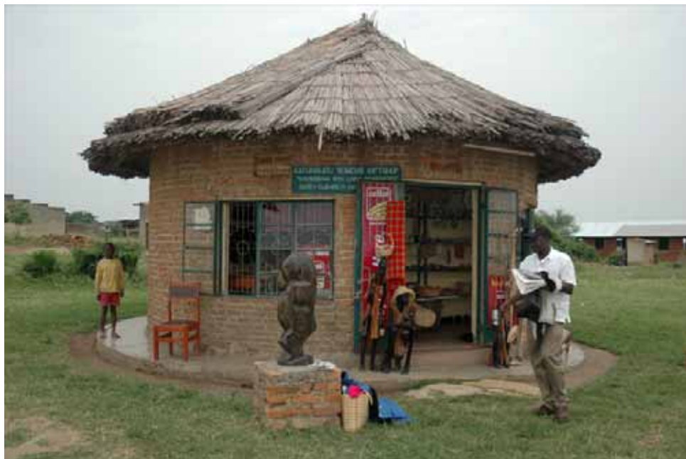
Katanguru women's gift shop near Queen Elizabeth NP

June 24, 2007 Visit to Ruhija Community, Meeting with Community leaders and members (IPC, LC1). New Gorilla Habituation Project – Spectacular drive, Mountains, high field and forests 2285m – CPI Community Protected Area Institution; Community resource assessment – swamps, waterfalls, old crafts, village tours; village heritage tours of: smithwork, dancing, forests and birds, lodges. Critical issues – 1) have land near the park but don't have financial resources to develop it; 2) urgency as tour companies buy land. Cody presented research on gorillas, habituation of gorilla family in 6 months (early 2008).