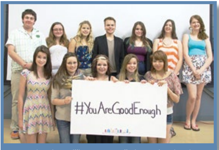
Students from William Morton Collegiate Institute launch their anti-abuse video—part of the P ortage Family Abuse Prevention Centre's Harmony Project

from local agencies, the community, and area First Nations. These trained educators then provided Healthy Relationships training to over 1,500 youth in various schools in Portage la Prairie and the surrounding rural catchment area. This training was the catalyst for students of a rural school to create the video #YouAreGoodEnough www.youtube.com/watch?v=3P_b_yj6H-M. A second video—Carry the Message—was also created by a The Portage Friendship Centre. Accreditation remains with the educators and workshops will continue beyond the Project's timeline.