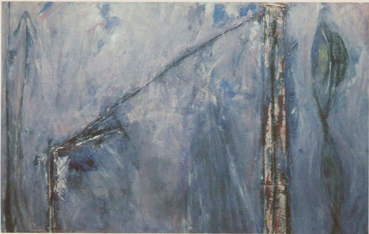
Charleswood 1 — 1982 — 5' x 8' mixed media on canvas