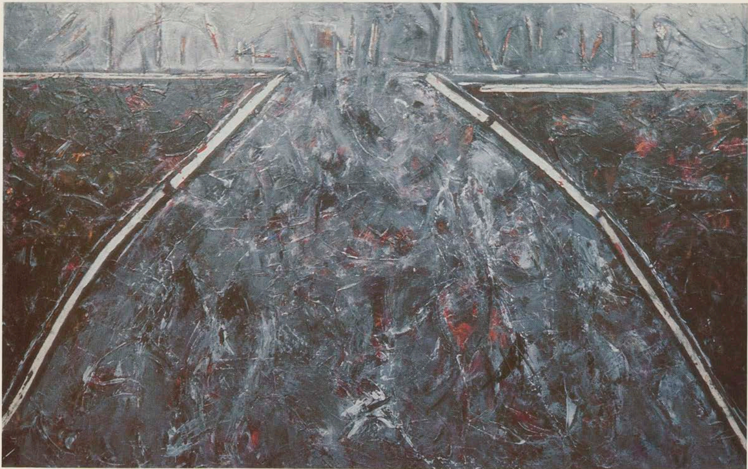
Charleswood 3 — 1982 — 5' x 8' mixed media on canvas