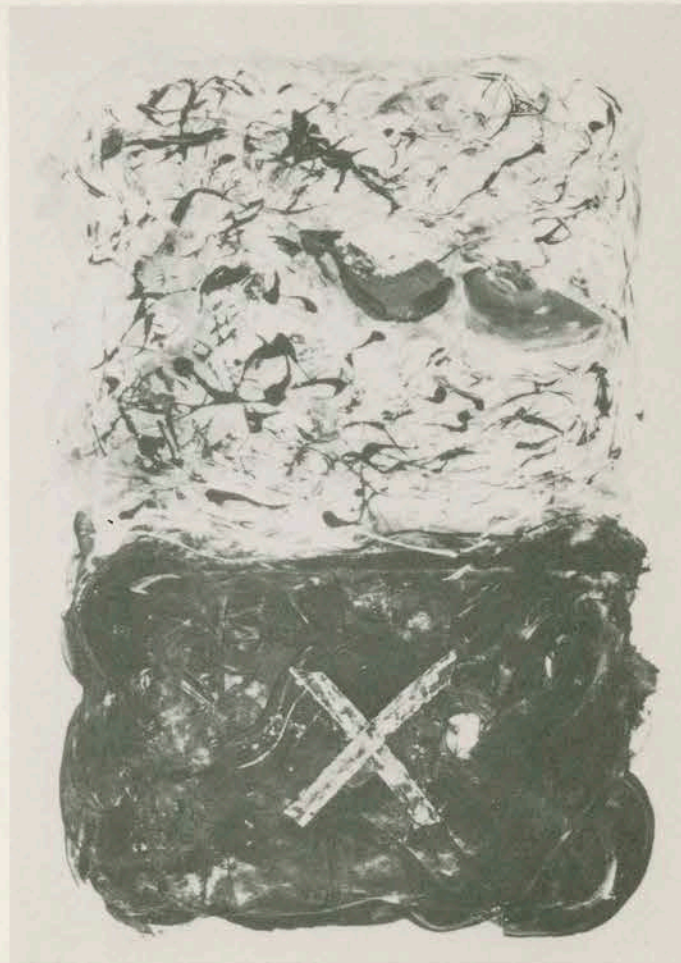
Untitled — 1980 — 30" x 42" mixed media on paper