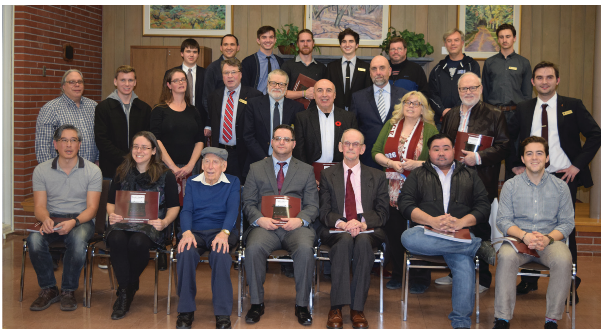
Former Paulinian Editors and Contributors at the Paulinian Retrospective Launch , November 2016