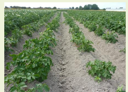
Potato populations on a BC farm

What's new? Regional coordinators from USC Canada have been conducting consultations with farmers. During these consultations farmers are asked to identify which varieties they are currently growing and why, as well as suggestions for parental varieties to be used in future crosses. Information collected about wheat and oat varieties was used to develop new crosses that will be distributed to farmers in 2014. Wheat and oats are currently planted in the greenhouse and crossing will take place in August.