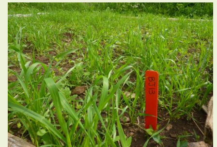
Population of wheat planted near Ottawa, Ontario.