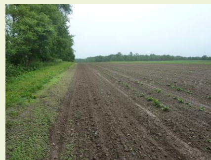
Potato populations on a Quebec farm