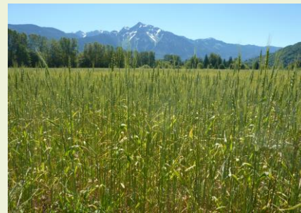
Population of Red Fife x 5602 HR cross planted near Agassiz, BC

While this is the first year of selection for many of the participating farmers, there are seven farmers that are on their third year of selection with the same populations. A portion of the wheat from each of these populations will be returned to the University of Manitoba for further agronomic and quality testing in 2014.