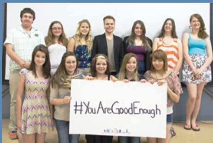
Students from William Morton Collegiate Institute launch their anti-abuse video—part of the Portage Family Abuse Prevention Centre's Harmony Project

Harmony Project... continued from Page 1