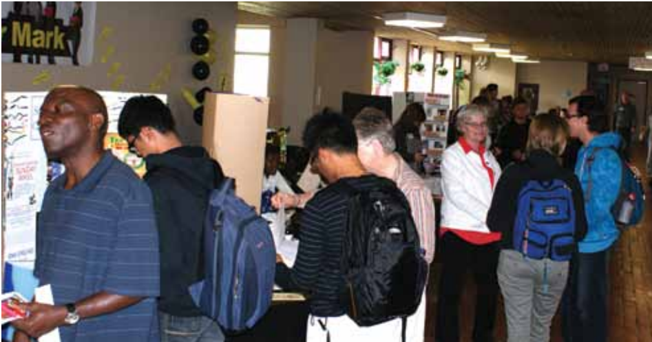
Students and V.A.S.E. participants fill the cafeteria on September 14, 2010

St. Paul's has a rich tradition of promoting justice and service to others. We have the whole body of Catholic Social Teaching, evolving over the centuries, to address challenges presented to us. We also have our Ignatian tradition of education in the service of others. For many of our students, their high school education provided them with the opportunity to experience some form of service learning. For us at the College, the ongoing question is how do we