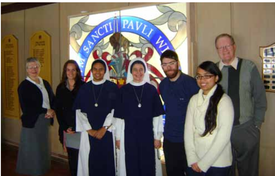
Sisters of Life visit the College on March 11, 2011

Among the other activities such as November and March Coffee Houses in Hanley Hall, the campus ministry