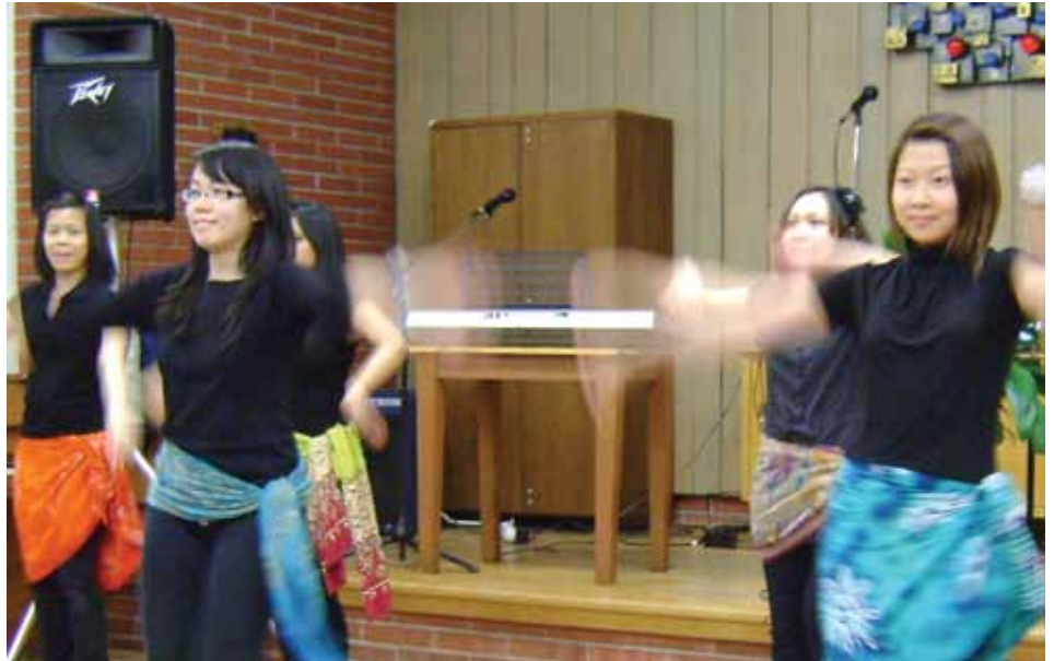
Performers at Coffee House