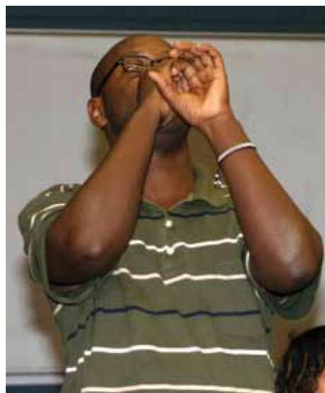
Above and Below: Storytellers and Peace Builders from the Amani People's Theatre in Nairobi, Kenya