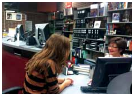
Library staff member assisting a student at the new circulation desk in the library

Although the arrival of autumn feels like an ending for many, to thousands of students attending university, fall heralds the beginning of another academic year. In the Father Harold Drake, SJ, Library, we see many new students, recognizable by the excitement, confusion or panic reflected in their faces. A sense of comfort is felt in welcoming back our returning students who continue to pursue their dreams.