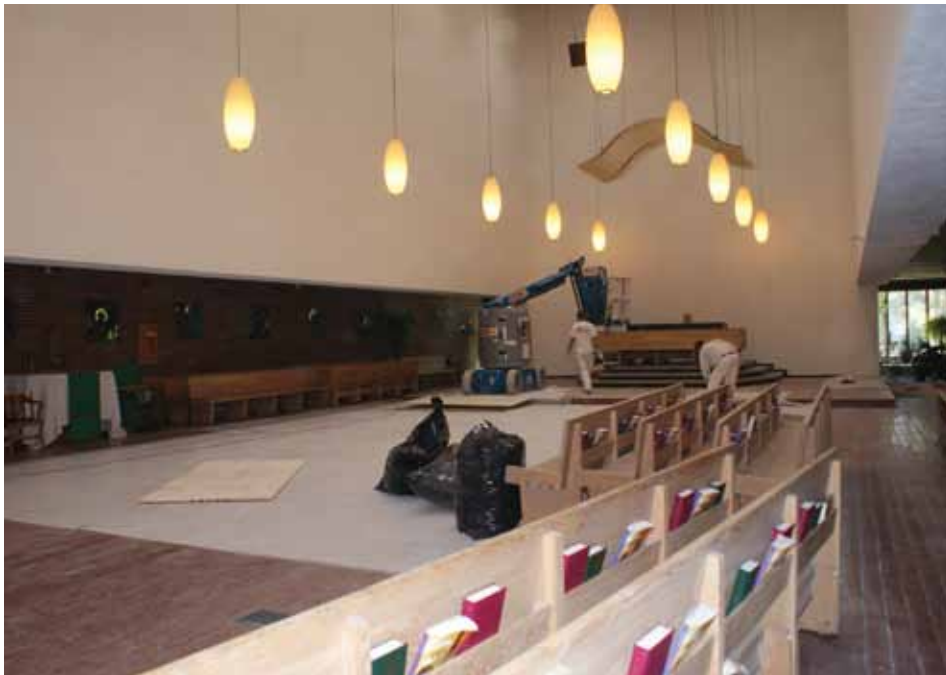
Chapel during the renovations

Director of Development, St. Paul's College