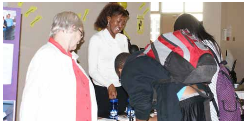
V.A.S.E. participants and students