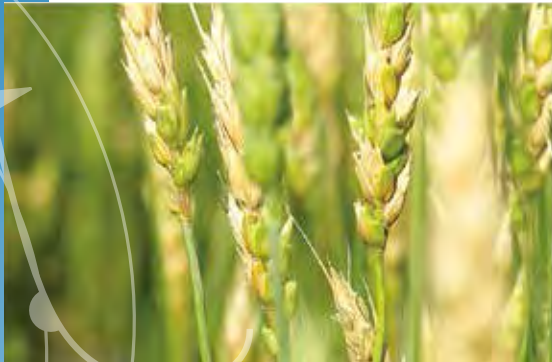
Wheat heads infected by the Fusarium pathogen. The infected seed will contain mycotoxins.