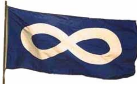
The National Flag of the Métis

To the Métis, 1870 was the Confederation of Manitoba and 1885 the final attempt to get Canada to keep the promises it had made in the Manitoba Act. These were not "rebellions" as far as they were concerned. The Métis sense of grievance stems from these two events and the death of Riel. Their memories of their lost land base and relegation to the sidelines of Canadian society, a period of time often referred to as "The Forgotten Years," festered in their national soul before they re-appeared on the Canadian scene in the late 1960's ready to assume their rightful place in the Canadian nation.